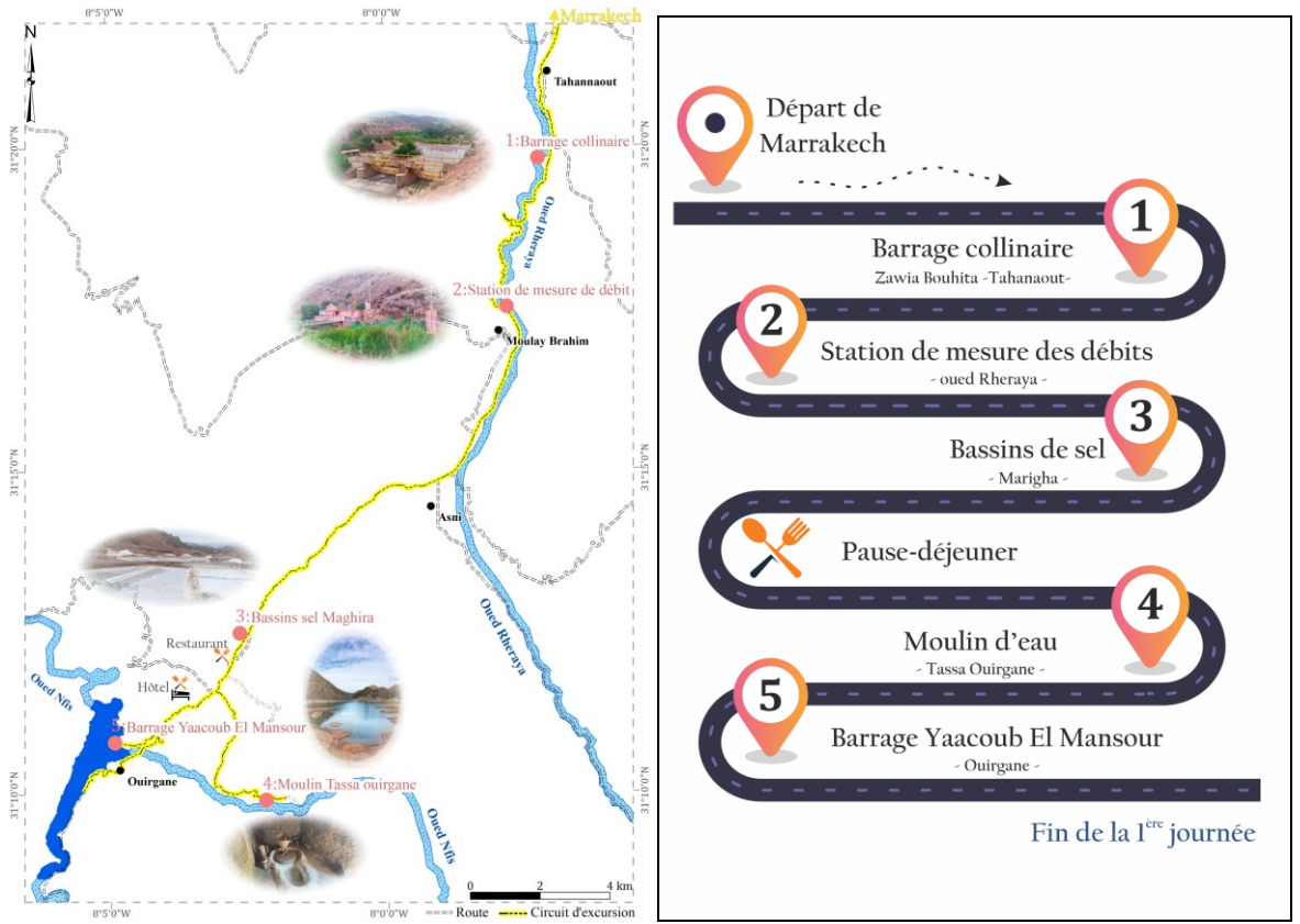
Map and Route of the 1st Day Trip