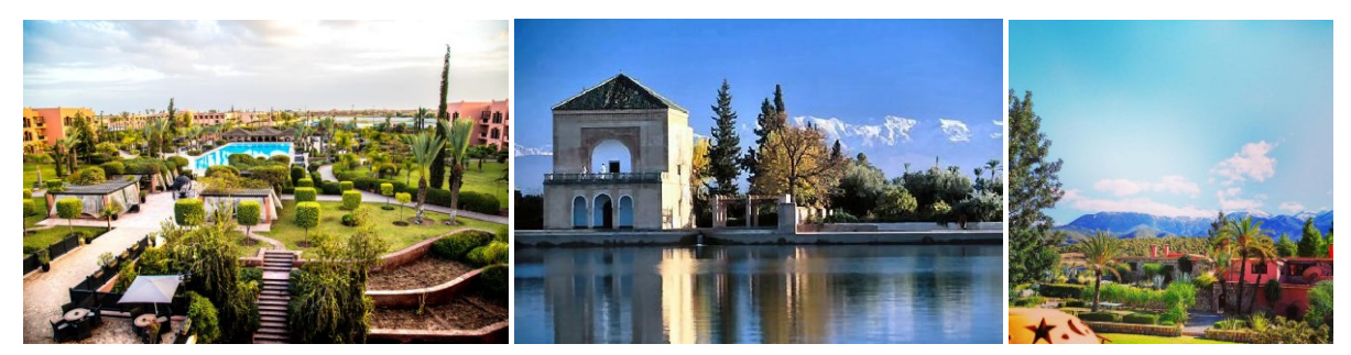
The Menara historical basin (12th cent.) and Royal Gardens with the High Atlas covered by snow