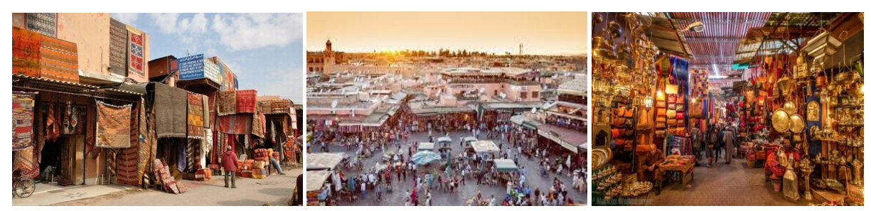
The Medina of Marrakech and the historical souk