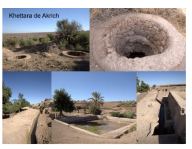
Palm groove with camels in the outskirts of Marrakesh (left) and aereal wells of the 'khettara' (underground canal system) of Akrich (right).